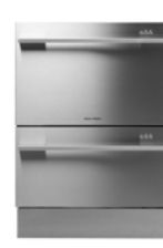
DD60DDFHX6 EZKleen stainless steel