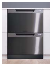
DD60DCHX6 EZKleen stainless steel

For more information on DishDrawer ® visit www.fisherpaykel.co.uk or call 0845 0662200.